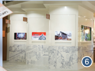
6 Signage (tourist information)