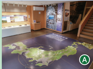
1F Exhibition Room

Presents the story of obsidian and Shimosuwa, including an introduction to the region's obsidian belt and its uniqueness as a production area.