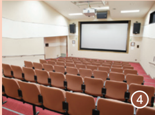
4 2F Theater Shows footage of the Onbashira Pillar Festival and Shimosuwa's history on a 200-inch screen.