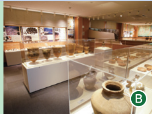
2F Exhibition Room

Presents the story of obsidian and Shimosuwa, including an introduction to the region's obsidian belt and its uniqueness as a production area.