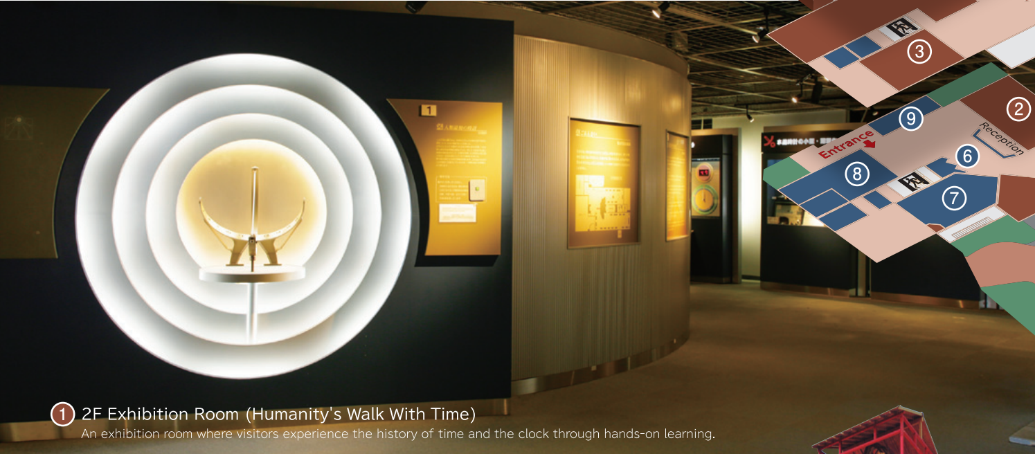
1 2F Exhibition Room (Humanity's Walk With Time) An exhibition room where visitors experience the history of time and the clock through hands-on learning.

Shimosuwa Konjakukan Oideya is a facility that consists of the Gishodo Clock Studio and the Hoshigato Yanoneya Museum. On the first floor, we offer seasonal information on walks around town via tourist brochures and digital signage.