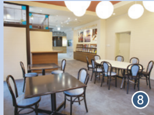
8 Coffee Shop