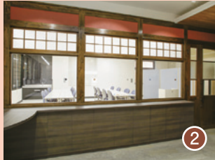
2 1F Clock Studio A workshop where everyone from kids to adults have fun making clocks.