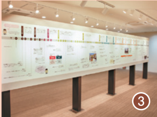
3 2F Exhibition Room (History of Shimosuwa) Presents the history of Shimosuwa from the Asuka period (538 AD – 710 AD) to the present day.