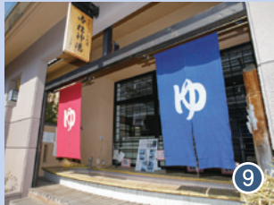
9 Foot Bath