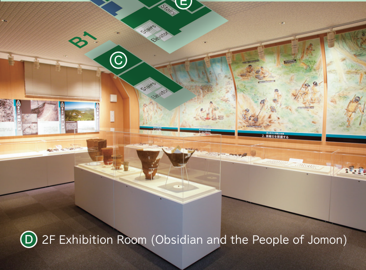
D 2F Exhibition Room (Obsidian and the People of Jomon)