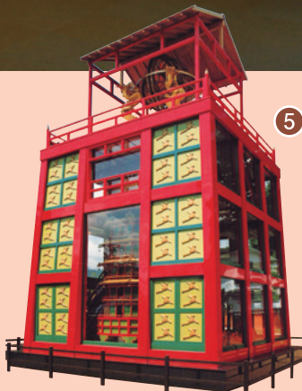
5 Water Clock Tower This completely restored hydro-powered astronomical clock tower is over 900 years old (demonstrations on the hour)